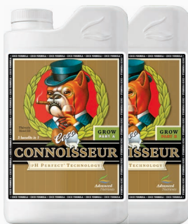
pH Perfect® Connoisseur Grow Coco A&B