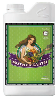
Mother Earth Super Tea Organic OIM