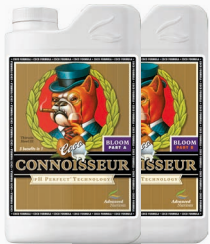
pH Perfect® Connoisseur Bloom Coco A&B