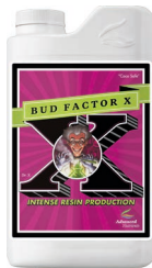
Bud Factor X