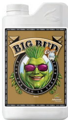
Big Bud® Coco