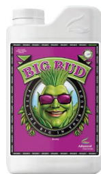
Big Bud Organic® OIM