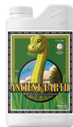
Ancient Earth® Organic OIM