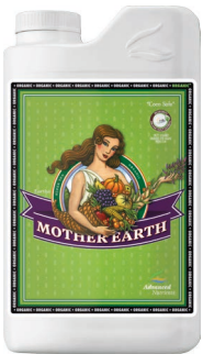
Mother Earth Super Tea Organic OIM