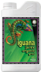
Iguana Juice Organic™ OIM Grow