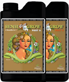
pH Perfect® Sensi Grow Coco A&B