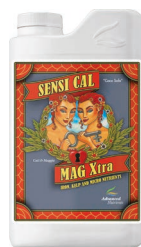
Sensi Cal- Mag Xtra®