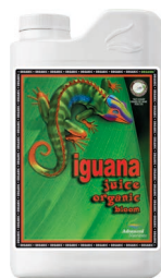
Iguana Juice Organic™ OIM Bloom