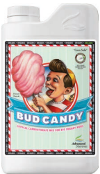
Bud Candy Organic™ OIM