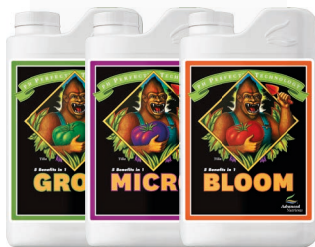
pH Perfect® Grow, Micro, Bloom