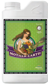
Mother Earth Super Tea Organic OIM