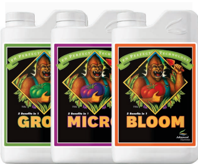
pH Perfect® Grow, Micro, Bloom