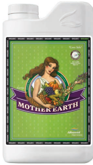
Mother Earth Super Tea Organic OIM