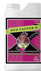
Bud Factor X