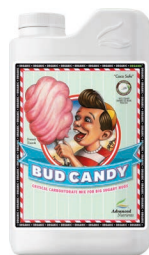
Bud Candy Organic™ OIM